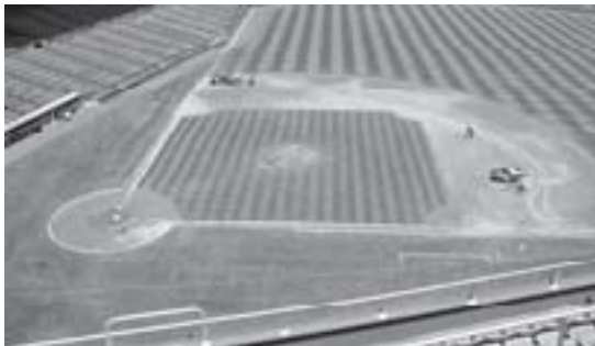
The view from our seats.

The lottery will be held Friday, March 3rd at 3 p.m. There will also be a drawing at the 1st Annual Baseball Lovers' Evening for the right to get first choice in the lottery. "Winners" will be awarded the top available tickets on their form at the time they are picked. Once a member has "won" tickets to a game, their name will be removed from the lottery. If any tickets remain after the lottery, a second lottery will be held. "Winners" will be informed following the lottery.