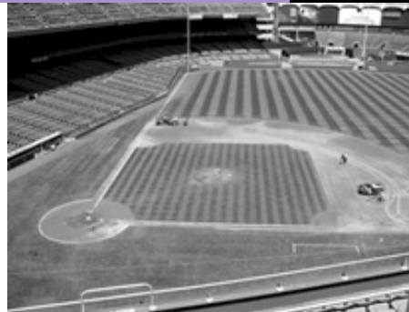
The view from our seats.

The lottery will be held Friday, March 26th at 3 PM. "Winners" will be awarded the top available tickets on their form at the time they are picked. Once a member has "won" tickets to a game, their name will be removed from the lottery. If any tickets remain after the lottery, a second lottery will be held. "Winners" will be informed following the lottery.