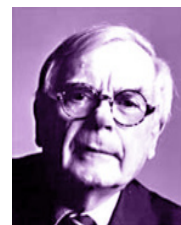
Annual Dinner Keynote Speaker Dominick Dunne '49