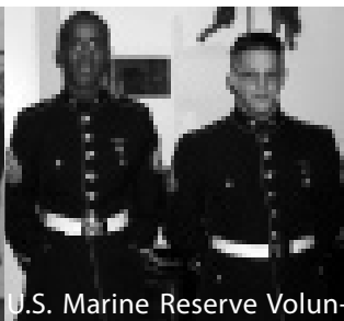
U.S. Marine Reserve Volun-