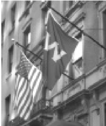
Reclaiming the W for 39th Street. What's old in new again as we hoist a new version of the traditional "W" flag above the Club's Main Entrance.