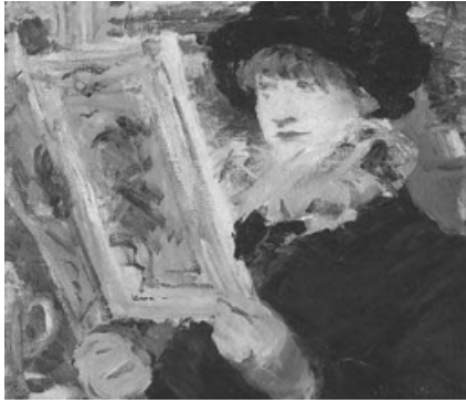
Edouard Manet's Woman Reading (1878-79) is just a sample of what awaits visitors to the Clark Art Institute during this year's Williamstown Arts Trip. See the full article on P5.