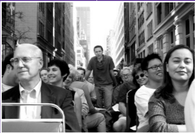
A sell-out crowd of Club members enjoy the top deck of the Beaux Arts bus tour.