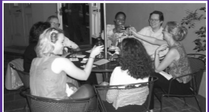
Reveling Club members enjoy drinks on the outdoor patio at the Club's Czech-themed cocktail party in